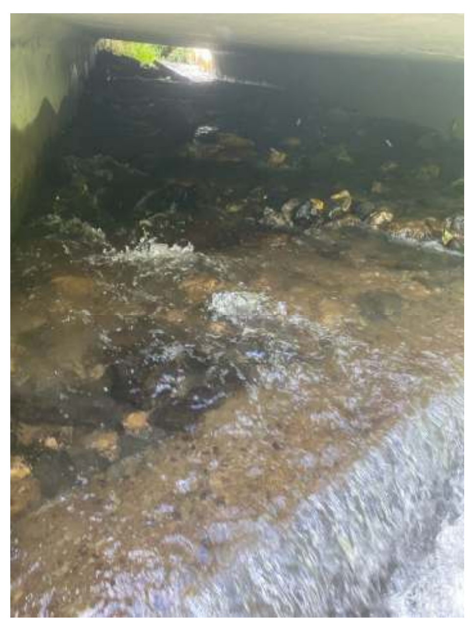
Yancey 175 about 100 feet upstream of Yancey 120 (note low hydraulic jumps at inlet in background and outlet in foreground).